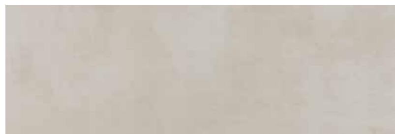
• Ageri Taupe 33,3x100 Rec. M64 031.627.0285.02566