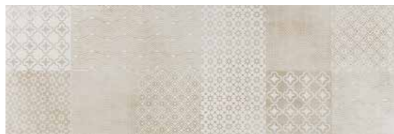
• Alessia Crema 33,3x100 Rec. M64 031.627.0096.09865