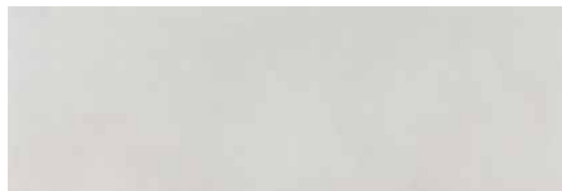
• Ageri Blanco 33,3x100 Rec. M64 031.627.0012.02566