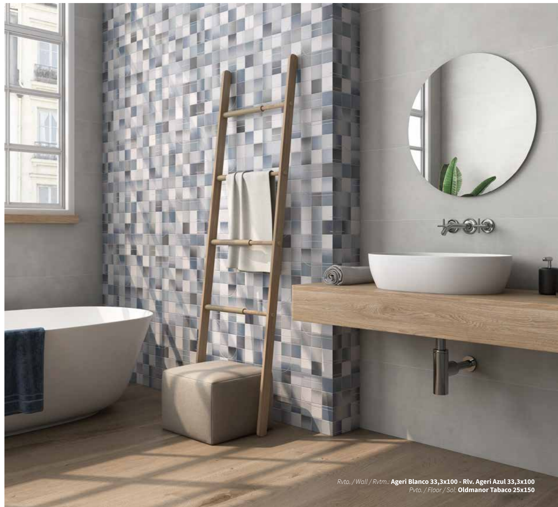
Rvto. / Wall / Rvtrm.: Ageri Blanco 33,3x100 - Rlv. Ageri Azul 33,3x100 Pvto. / Floor / Sol: Oldmanor Tabaco 25x150