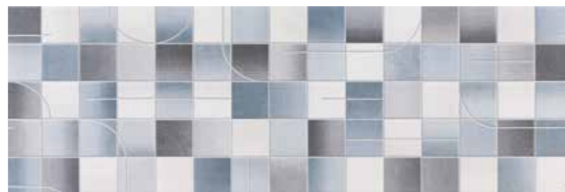
• Rlv. Ageri Azul 33,3x100 Rec. M64 031.627.0004.04726