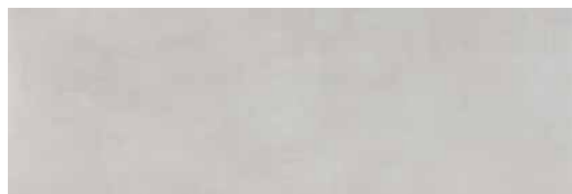
• Ageri Ceniza 33,3x100 Rec. M64 031.627.0019.02566