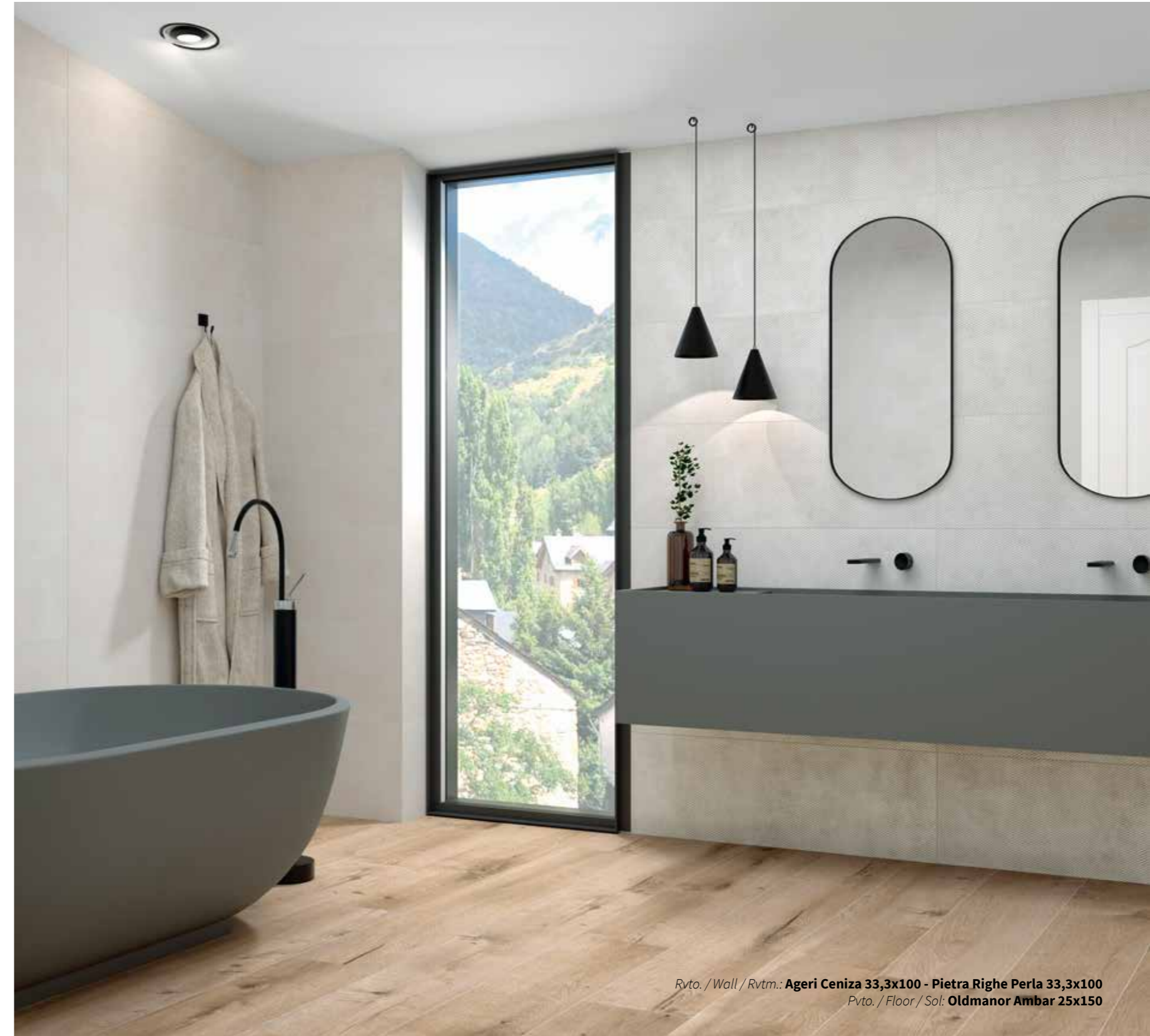
Rvto. / Wall / Rvrm.: Ageri Ceniza 33,3x100 - Pietra Righe Perla 33,3x100 Pvto. / Floor / Sol: Oldmanor Ambar 25x150

• Mold. Metal Bronce Brillo 1,5x100 P39 032.430.0336.01211